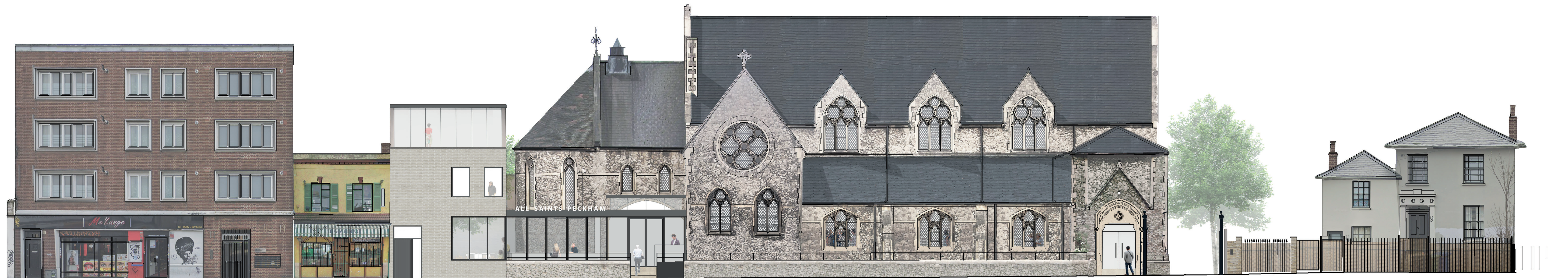
The proposed north elevation of the church to Blenheim Grove