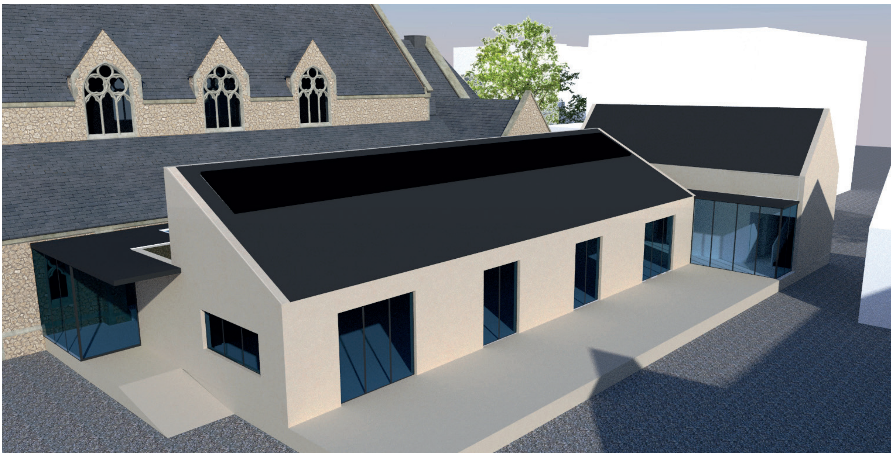
The proposed new hall from the south, showing the two new volumes and glazed linking elements