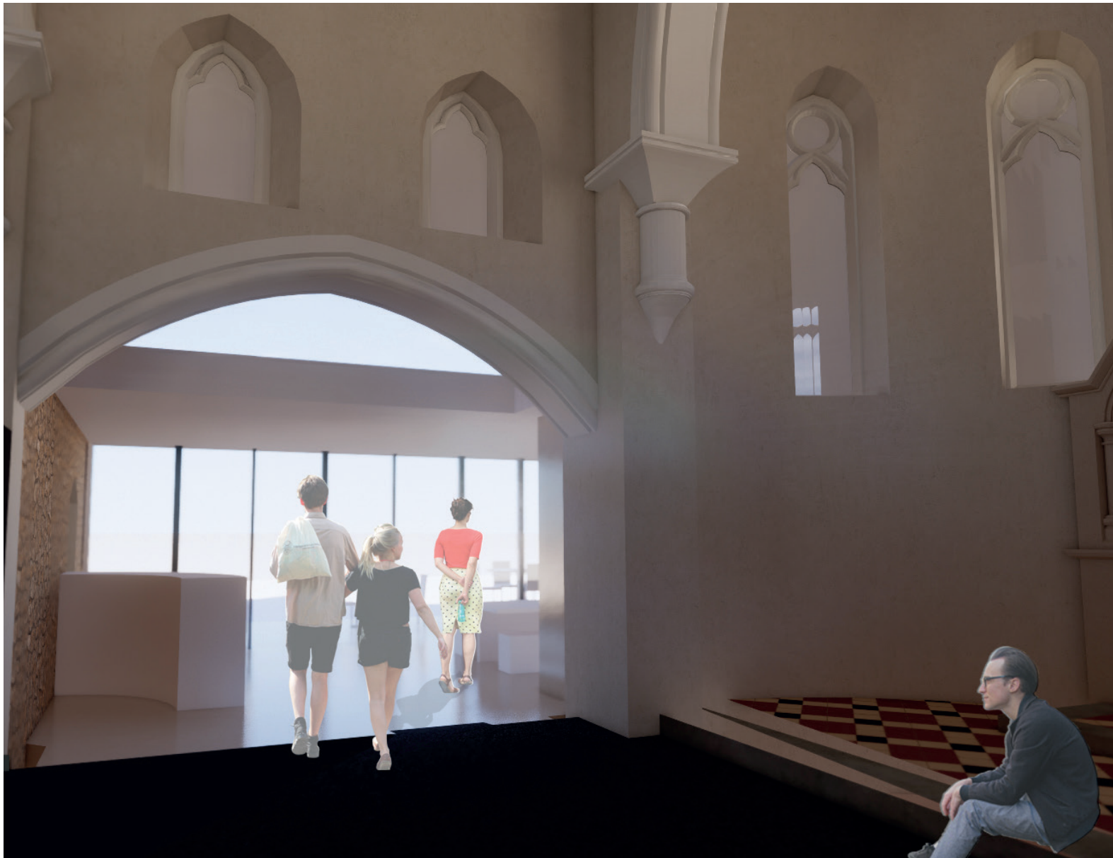
View of the new entrance from the chancel with the arch opened up