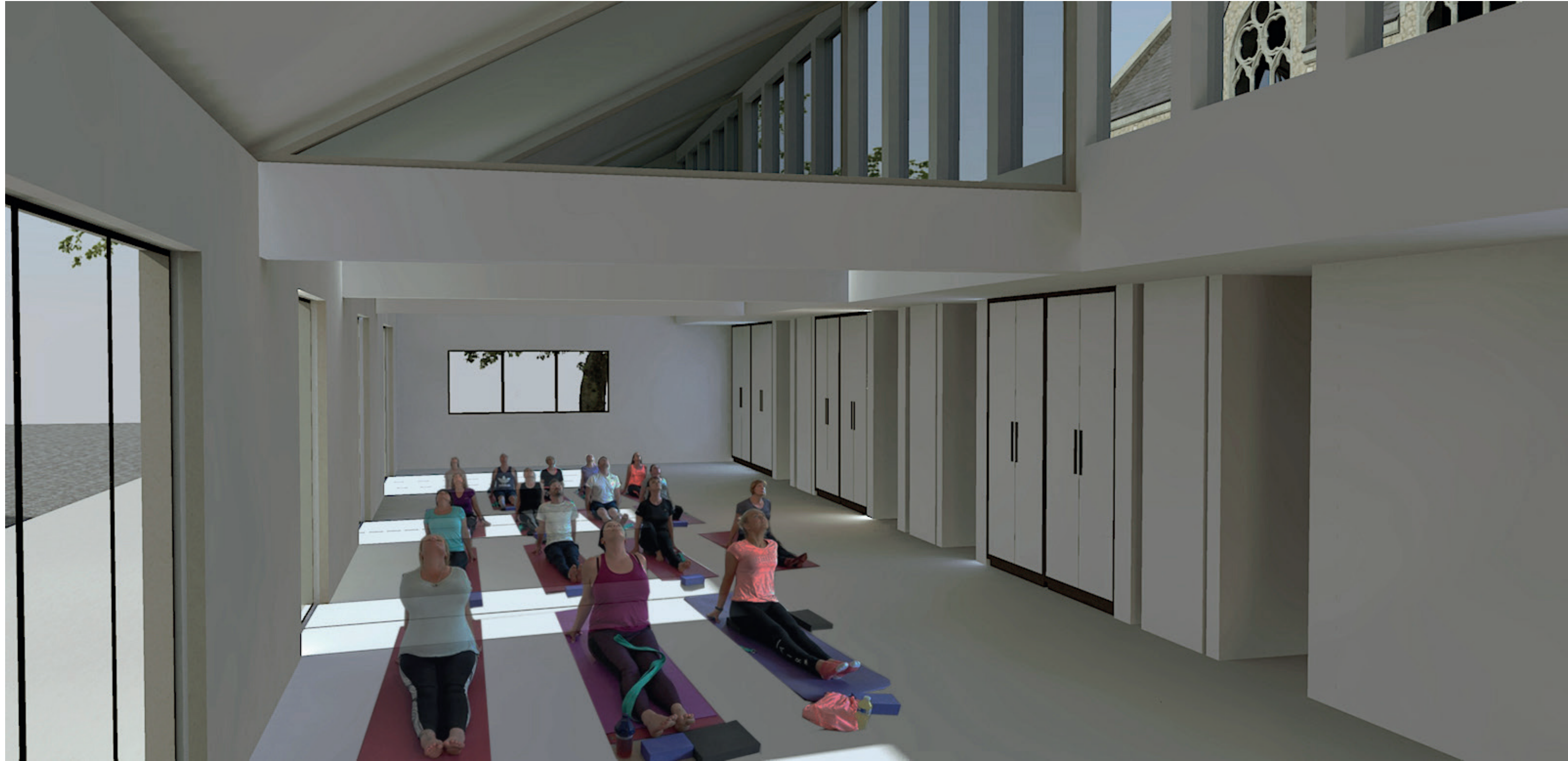
Internal view of the new all looking west, with clerestory views of the church