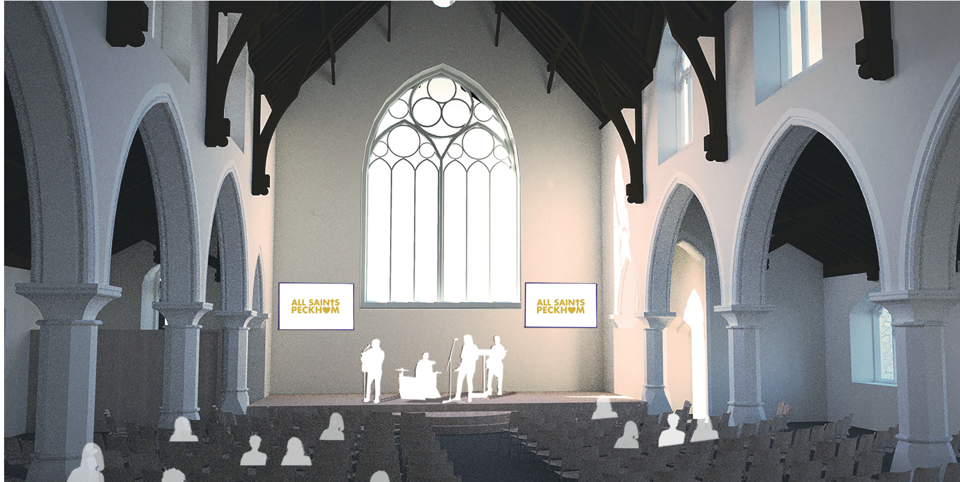
View to the proposed west stage with the direction of worship re-oriented