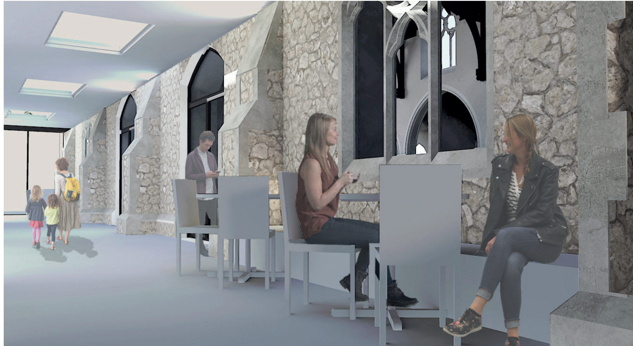
View of the internal linking passageway between the South Aisle of the church and the new hall