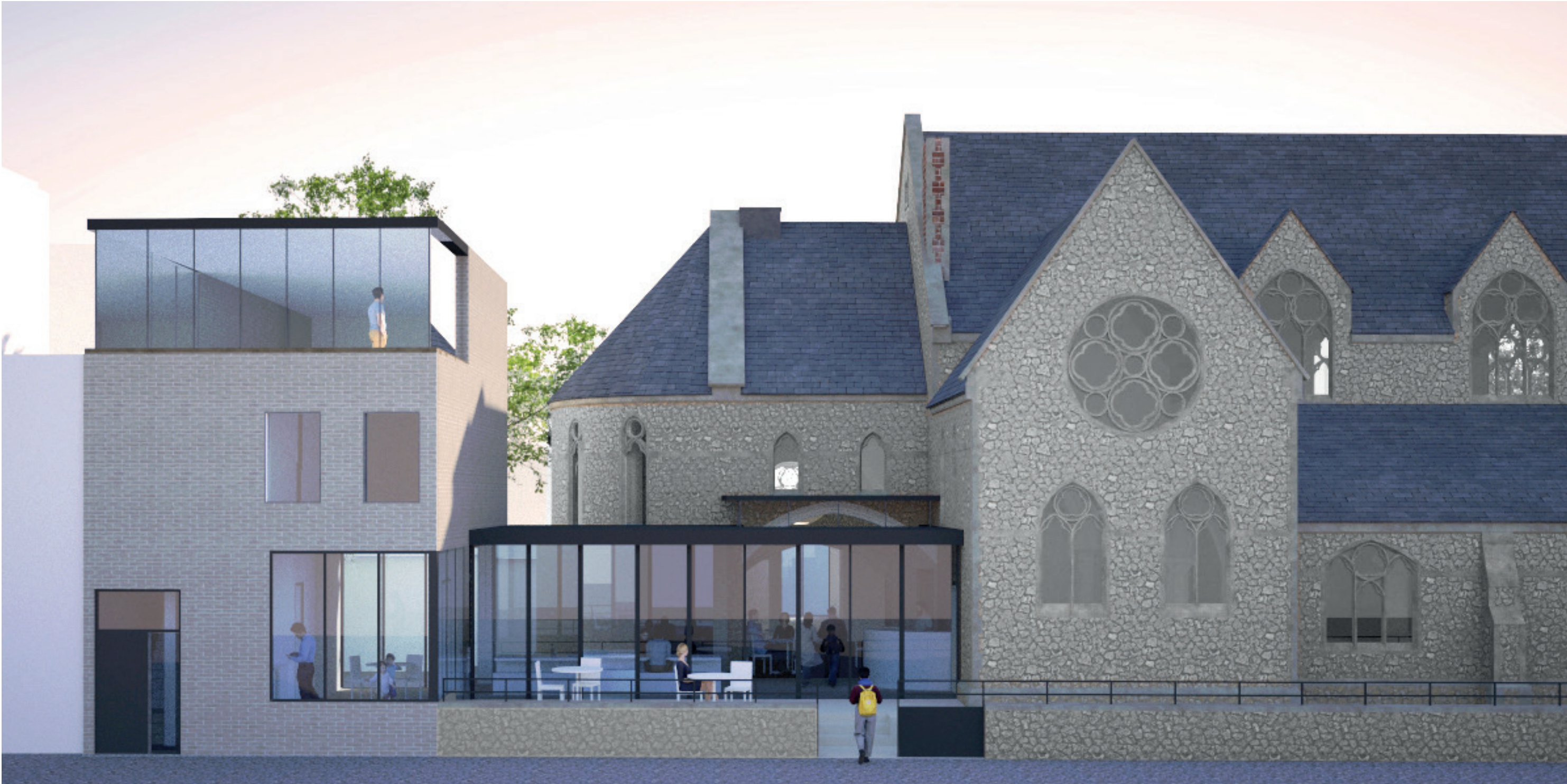
The proposed new entrance pavilion and 'shopfront' parish offices facing Blenheim Grove