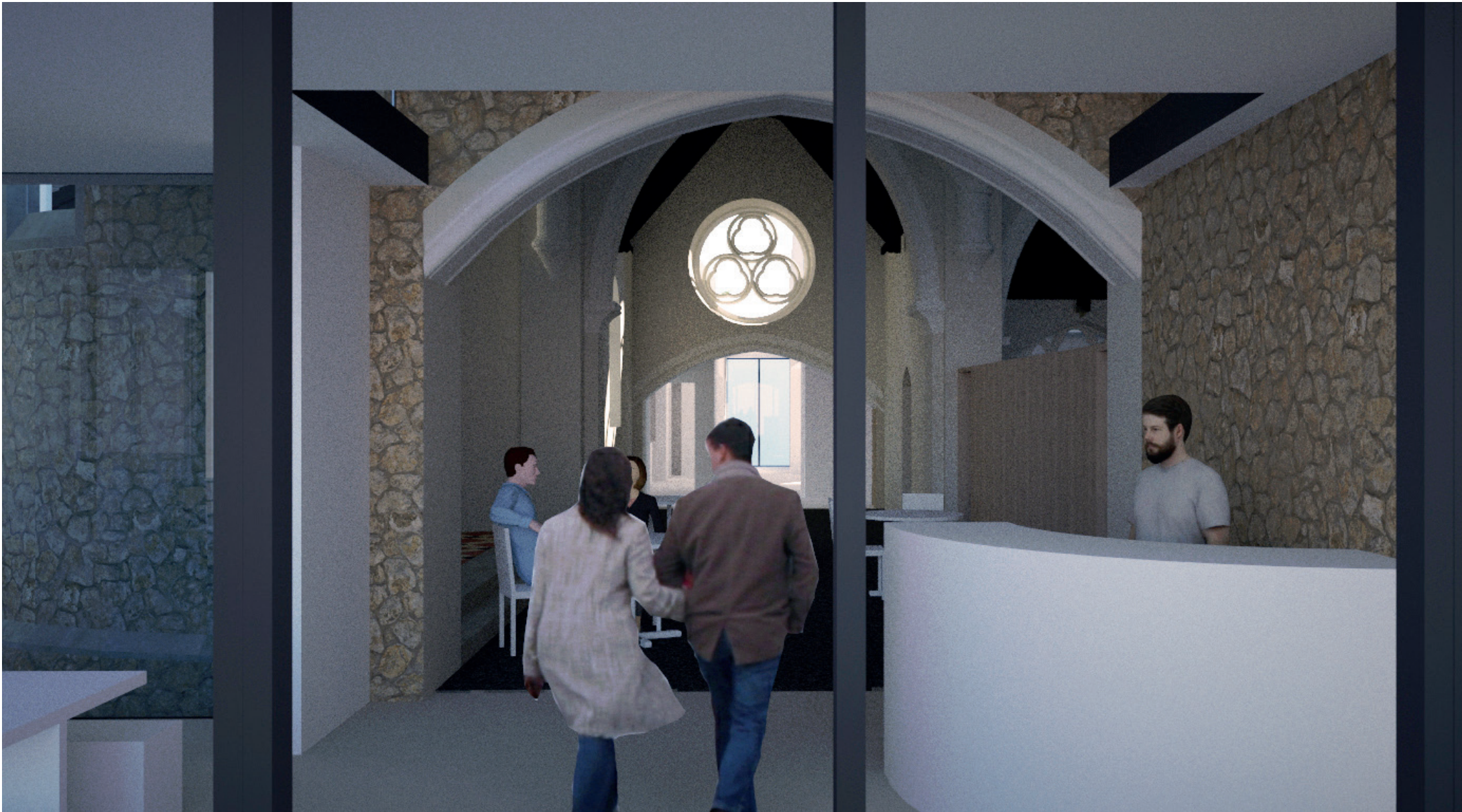
The proposed new welcome area looking through to the church and hall