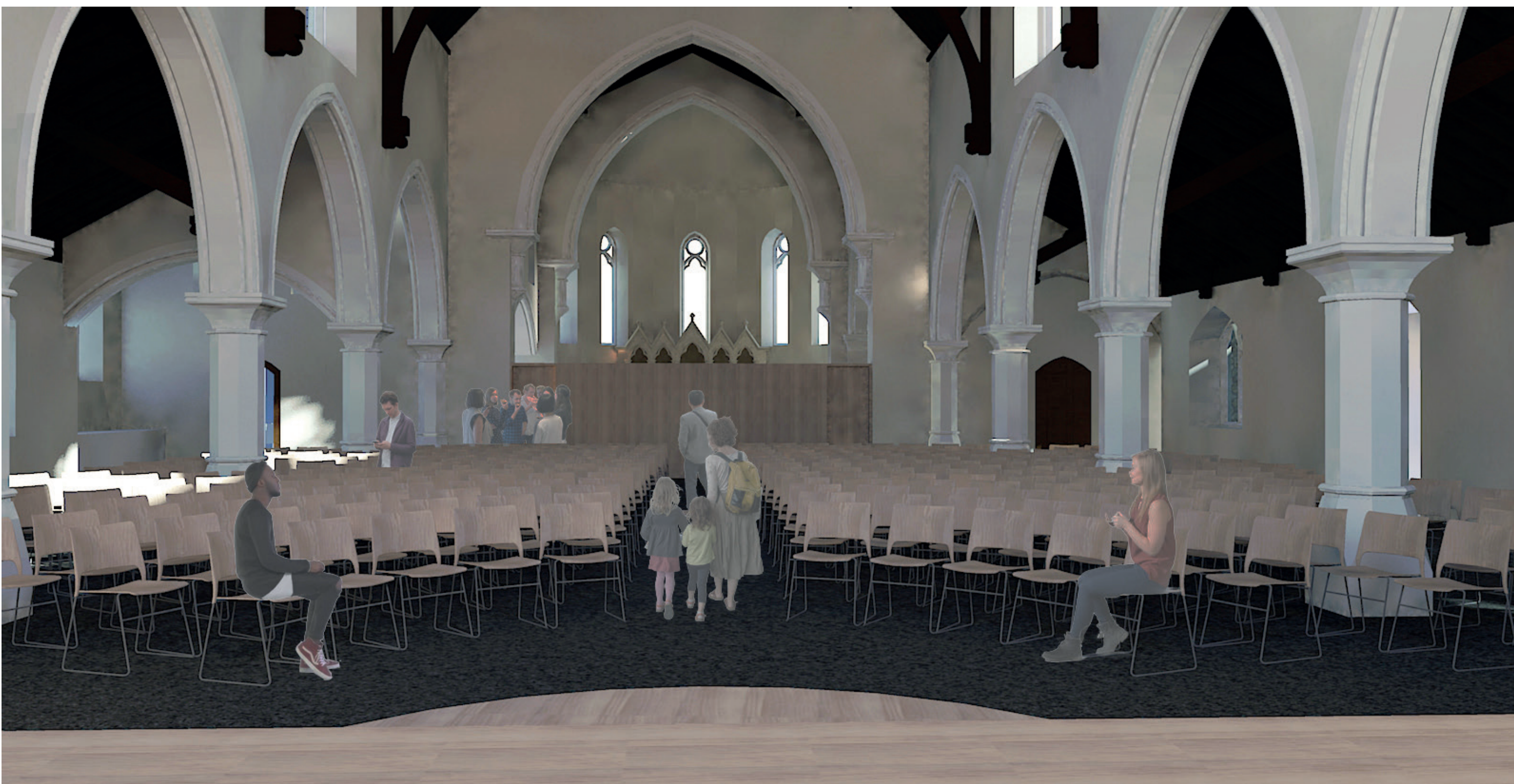
View from the west stage towards the chancel and screen with the direction of worship re-oriented